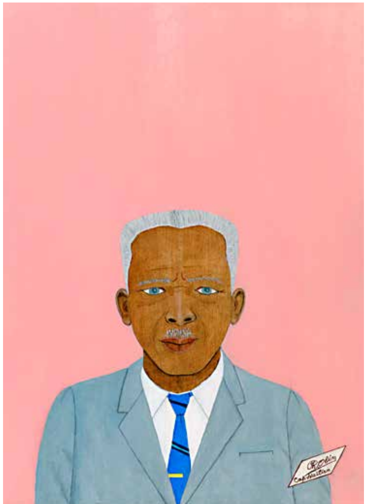
(right) Philomé Obin, Haitian, 1892–1986, Self-portrait, circa 1980, Oil and graphite on Masonite, Figge Art Museum, Dedicated in Memory of George S. Nader, 2014.1